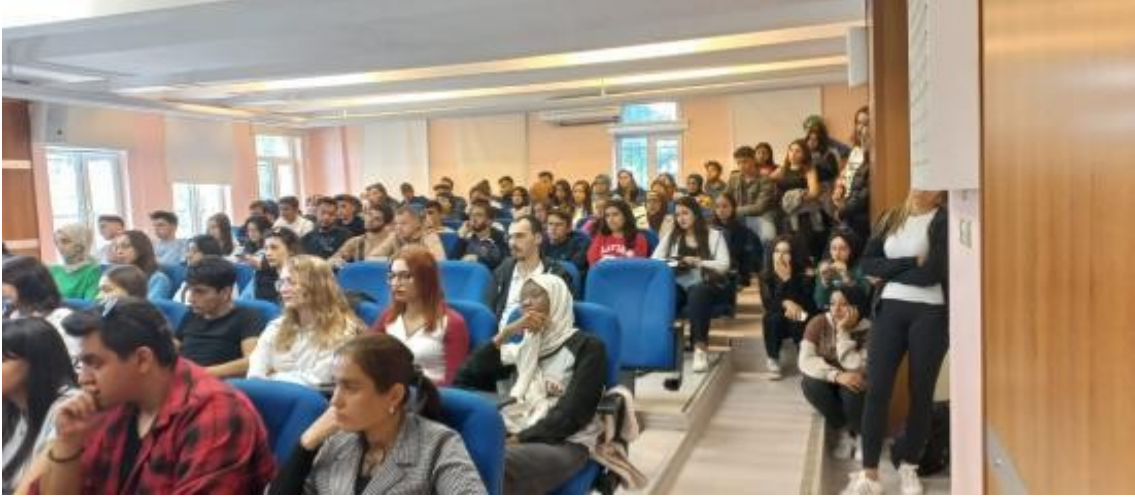
Alumni and Student Gathering