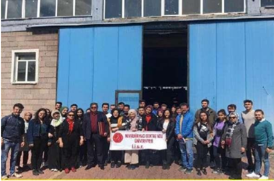
OMS Machine Ind. & Trade Ltd. Co. 08.05.2019 Betek Paint and Chemicals Industry Ltd. factory

Society, all operating within our faculty, aim to contribute to our students' academic, social, cultural, artistic, scientific and personal development in their respective fields.