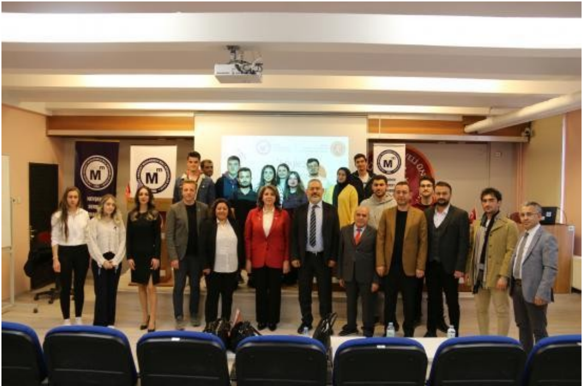
"Let's Meet for a Discussion – The Profession of Chartered Accountant" Event Organised