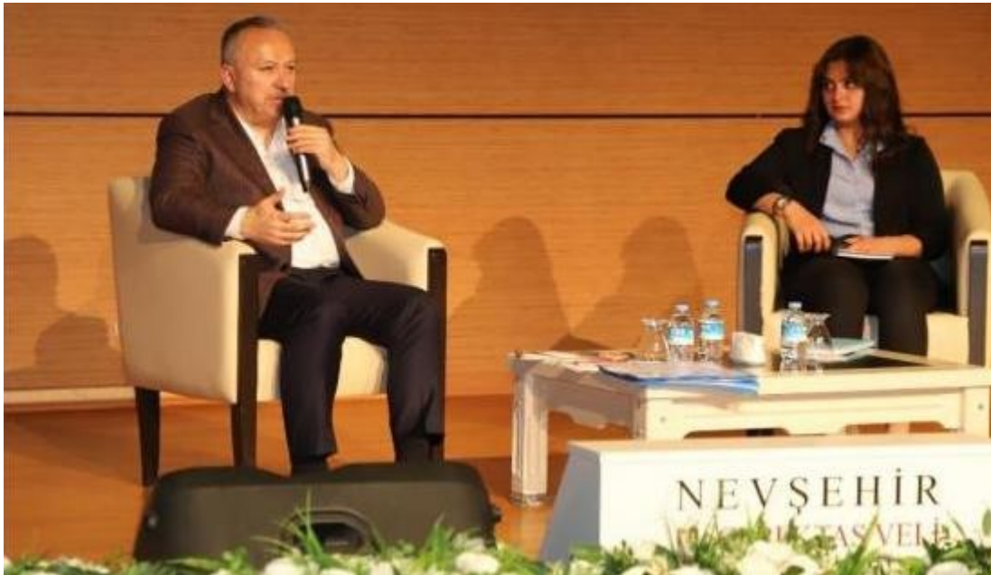
Nevşehir Governor Fidan Met with Our Faculty Students for a Discussion.