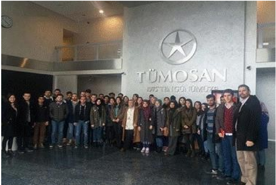
Technical visit to TÜMOSAN organised by the Logistics and Development Club