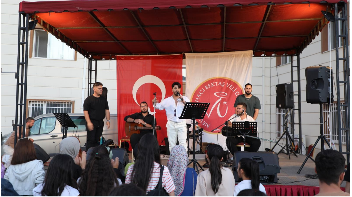
Nevşehir Hacı Bektaş Veli University Students Organise a “Welcome to University Concert”

To contribute to the academic and social development of our students, our faculty organises İİBF Conferences, Career Days, various seminars and congresses in collaboration with external partners.