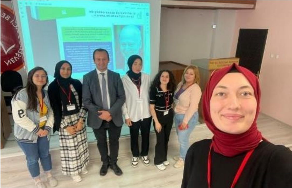
An event titled "Diplomacy Readings" organised by the International Relations Society