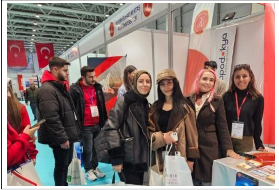
Our faculty students and academic staff attended the Central Anatolia Career Fair (ORAKAF).