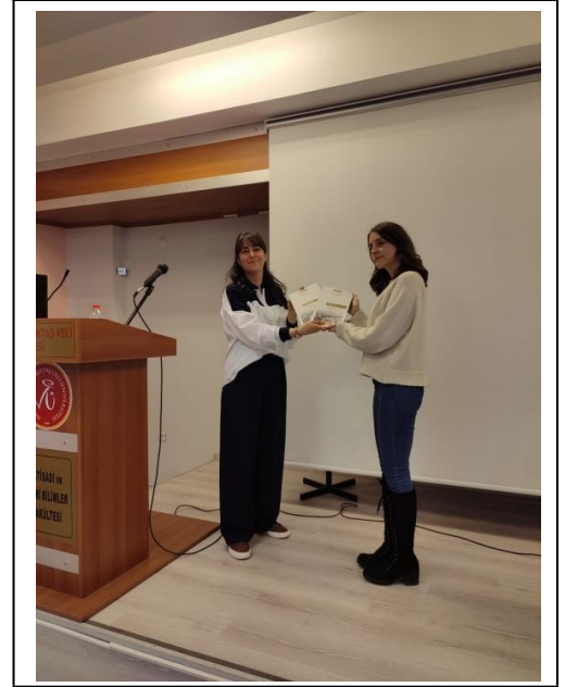
"Effective Communication and Body Language" Discussion