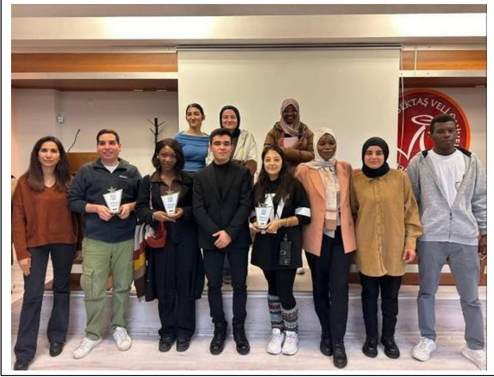
International Students' Union Debate Event