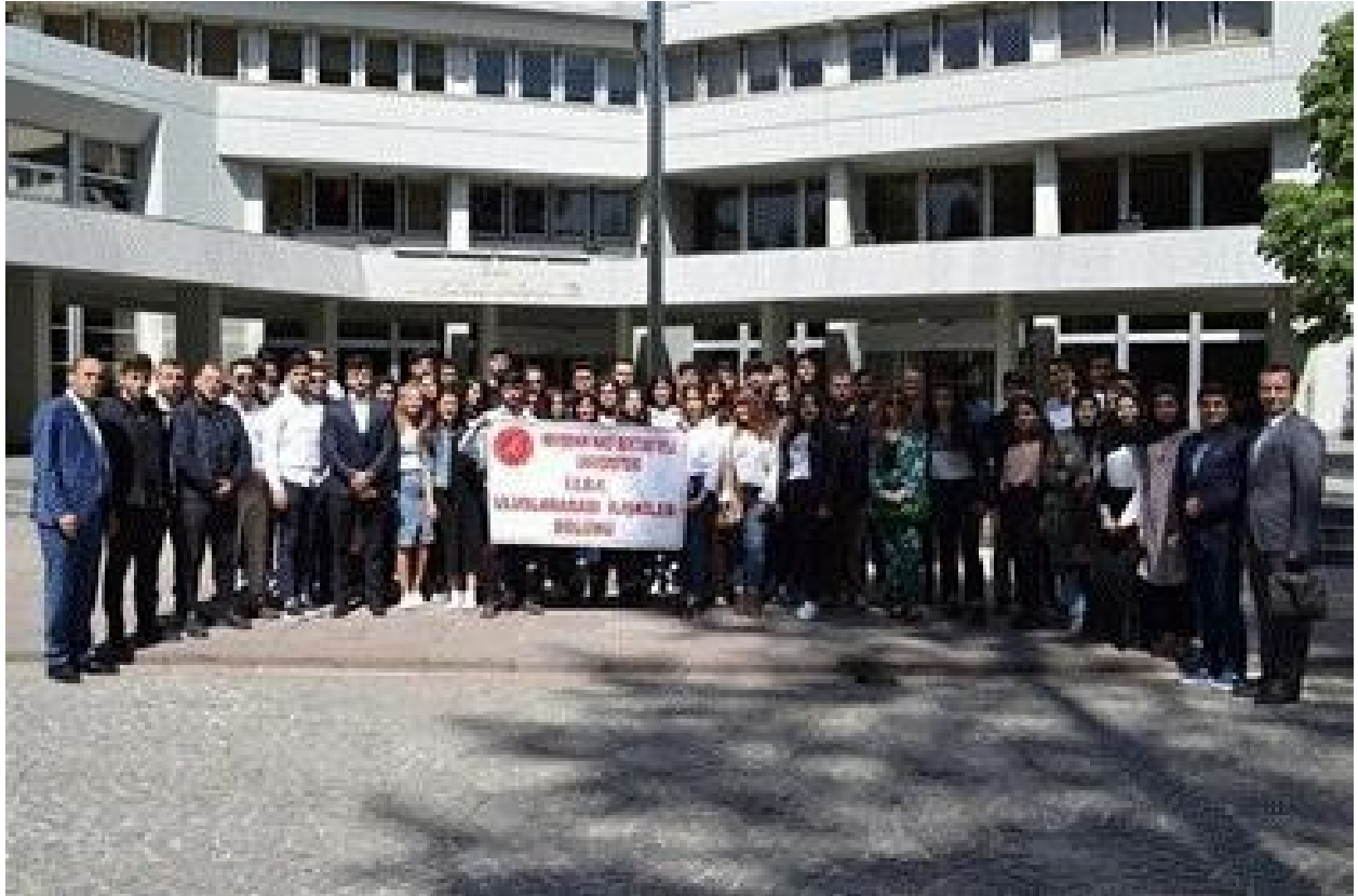
Technical visit organised by the International Relations Department to the Ministry of Foreign Affairs in Ankara