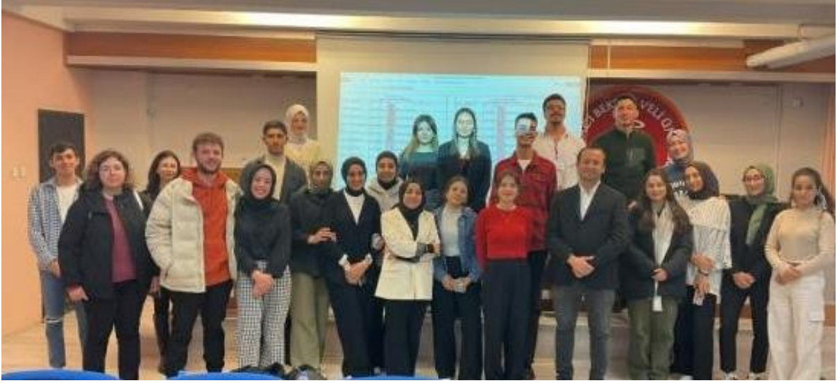
The Ordinary General Assembly of our International Relations Society