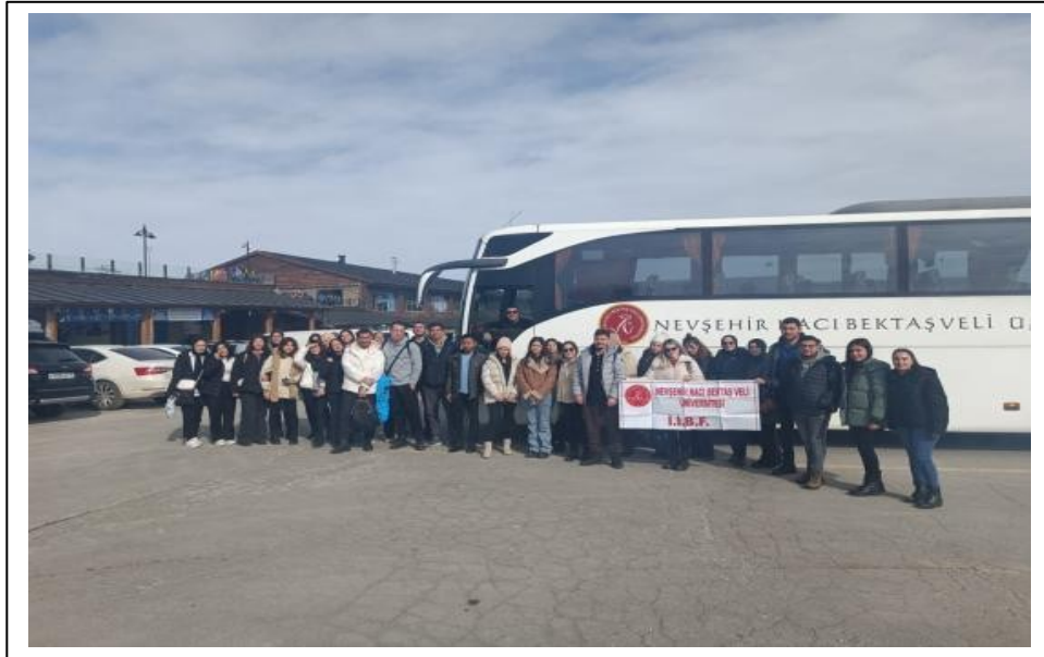
A Trip to Mount Erciyes in Kayseri Was Organised