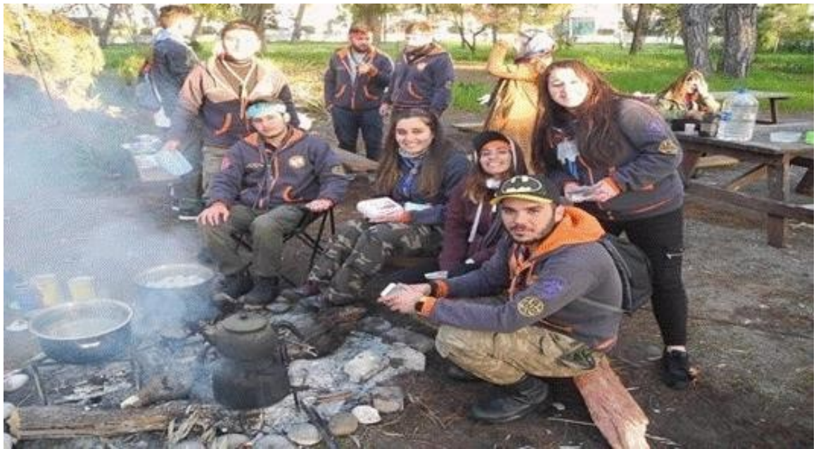
Scouting Club's trip to Mersin