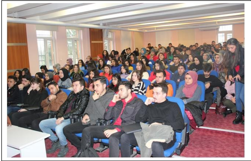
Occupational Health and Safety Training