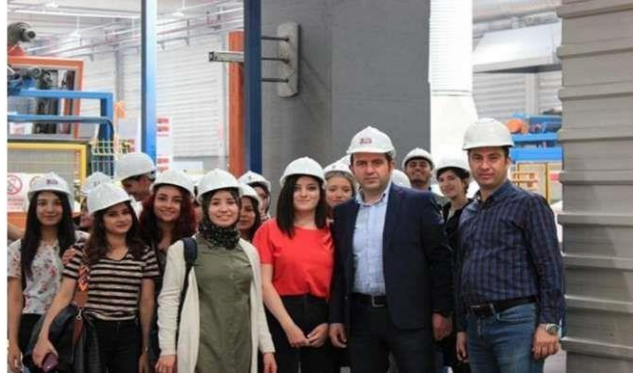
Technical visit organised to the Technical visit to the factory