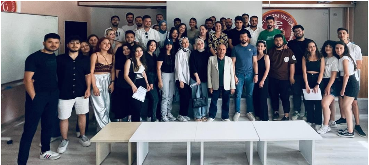
At the event attended by academic staff from our Faculty's Department of International Relations and students graduating from the department in the 2023-2024 academic year, certificates of achievement were presented to the top-performing students.