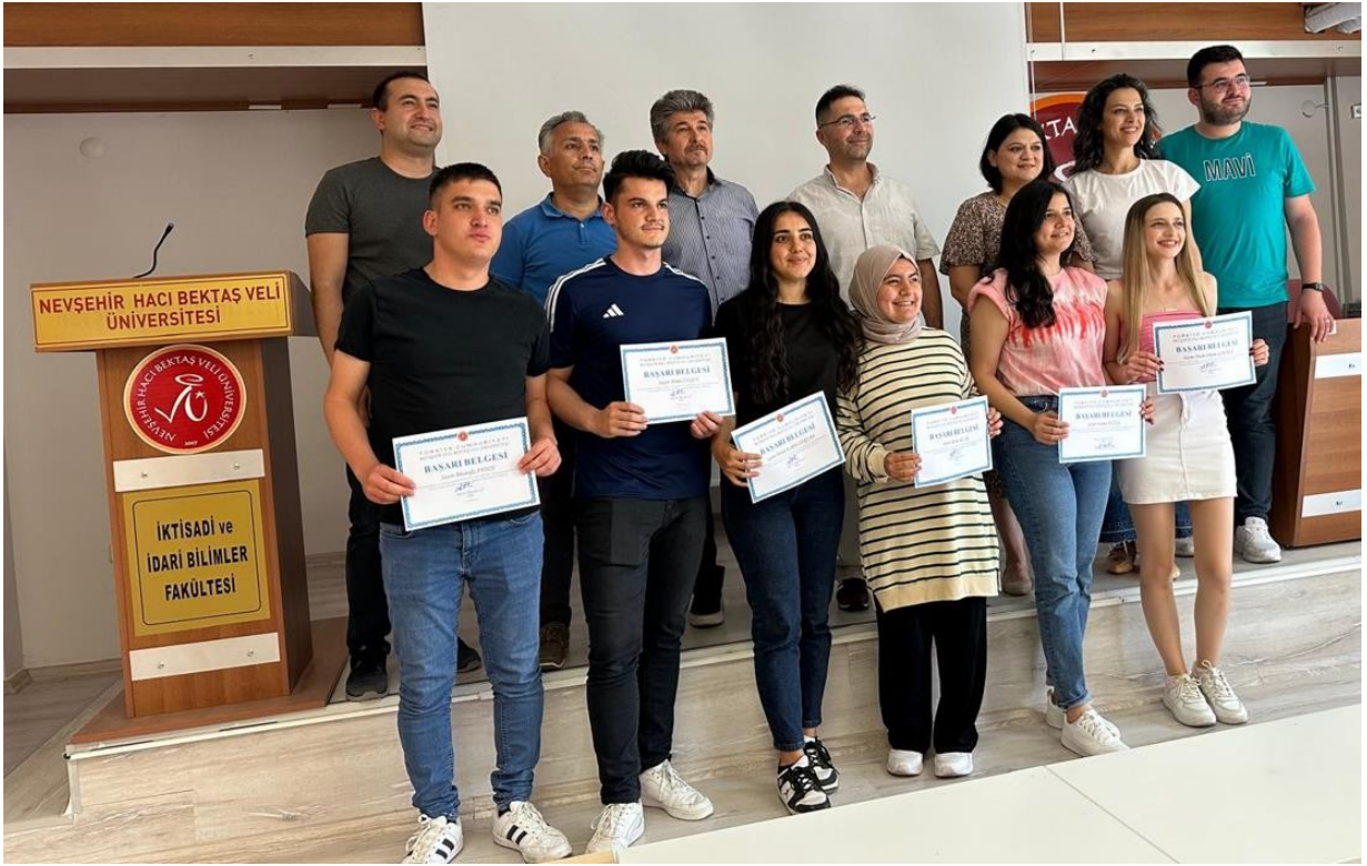
At the event, which took place with the participation of Public Administration students graduating in the 2023-2024 academic year, certificates of achievement were presented to the top-performing students.